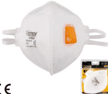
CE 3PCS FFP2 VALVED DUST MASK FILTER AND FOLDING DESIGN