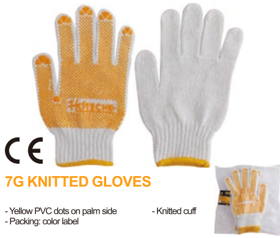
CE 7G KNITTED GLOVES