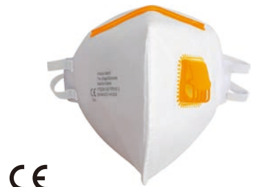
CE 10PCS FFP2 VALVED DUST MASK FILTER AND FOLDING DESIGN