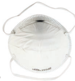
CE 10PCS FFP1 DUST MASK