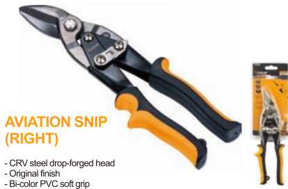
AVIATION SNIP (RIGHT)