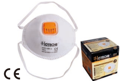
CE 10PCS FFP1 DUST MASK WITH VALVE