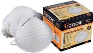
50PCS DISPOSABLE DUST MASK