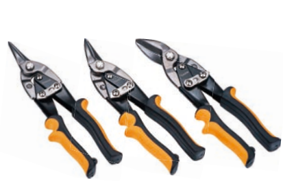
3PCS AVIATION SNIP SET