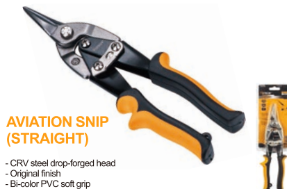
AVIATION SNIP (STRAIGHT)