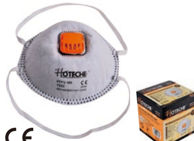
CE 10PCS FFP2 DUST MASK WITH VALVE