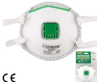
CE 2PCS FFP3 DUST MASK WITH VALVE