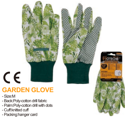
CE GARDEN GLOVE