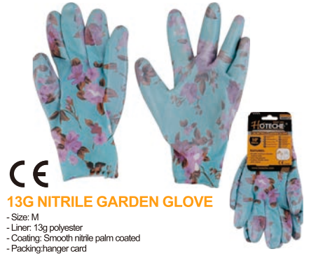
CE 13G NITRILE GARDEN GLOVE