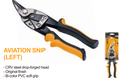
AVIATION SNIP (LEFT)