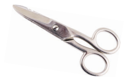
KEVLAR FIBER SHEARS