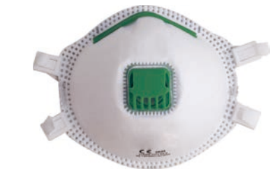
CE 10PCS FFP3 MALVED DUST MASK FILTER