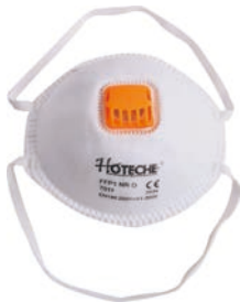
CE 10PCS FFP1 DUST MASK WITH VALVE