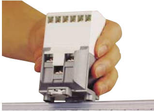
To mount on 35mm DIN rail