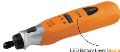
LED Battery Level Display

110PCS Mini Grinder Meas:66x23.5x36cm/10pcs G.W/N.W: 12/11kgs Quantity 20ft: 5100pcs