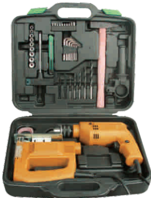
Item No. PTPK15 Power Tool set