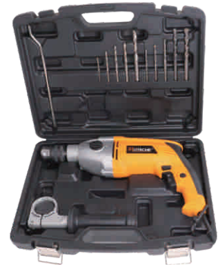
Item No. PTPK14 Power Tool set