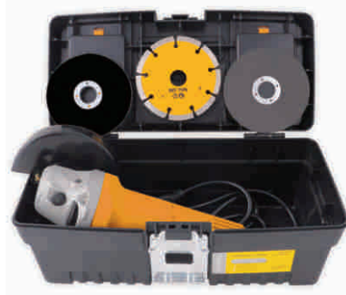
Item No. PTPK10 Power Tool set