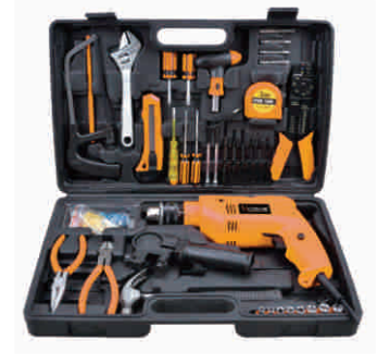
Item No. PTPK11 Power Tool set