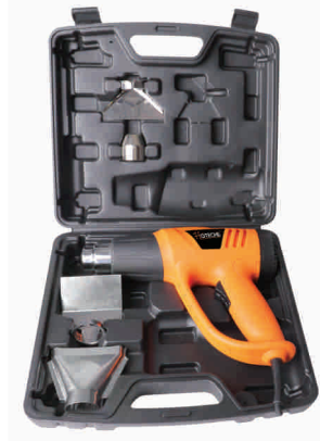
Item No. PTPK13 Power Tool set