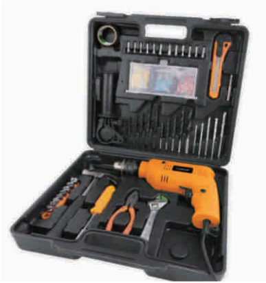
Item No. PTPK09 Power Tool set