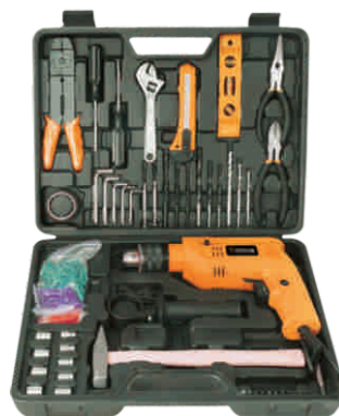
Item No. PTPK16 Power Tool set