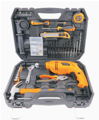
Item No. PTPK12 Power Tool set